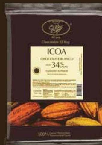
1 kg Bar

Uses: Couvertures, ganache, glazing, ice cream, molding, mousses, part of the dough of a product, fillings, sorbets, sauces, bonbons, drinks.