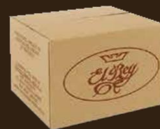
Box for Discs Bags

Fourteen (14) months from elaboration date, if stored under the suggested conditions.