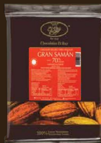
1 kg Bar

In Chocolates El Rey, products are molded in bars and discs to facilitate melting as necessary.