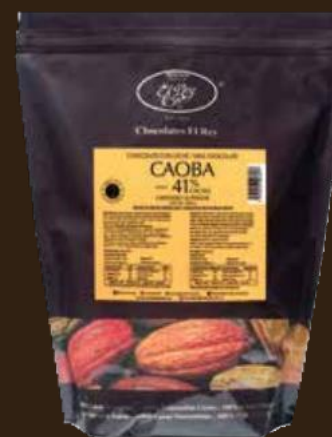
2 kg Discs Bags