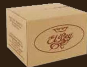
Box for 1 kg Bars