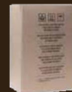
Case for 2 kg Discs Bags