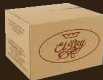
Box for Discs Bags