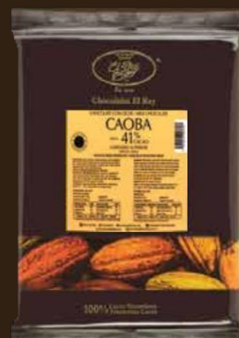
1 kg Bar

In Chocolates El Rey, products are molded in bars and discs to facilitate melting as necessary.