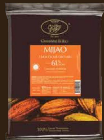
1 kg Bar