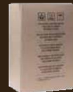
Case for 2 kg Discs Bags