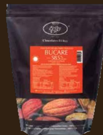
2 kg Discs Bags