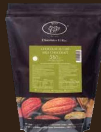
2 kg Discs Bags

A chocolate in which the cacao solids content is more than 56%. It is made with 100% Venezuelan Carenero Superior fermented cacao liquor, refined sugar, cacao butter, skim milk powder, whole milk powder, soy lecithin as an emulsifier, flavored with natural vanilla. It is a chocolate with little sugar added and a touch of milk to soften the fruit acidity and add smoothness that boosts a long and delicate cacao linger in the palate.