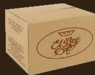
Box for Discs Bags

Shelf life: Twenty-four (24) months from elaboration date, if stored under the suggested conditions.