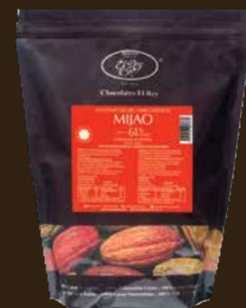
2 kg Discs Bags