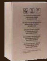
Case for 2 kg Discs Bags