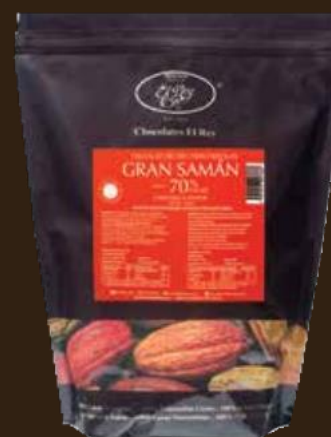
2 kg Discs Bags