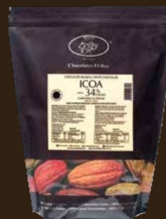
2 kg Discs Bags