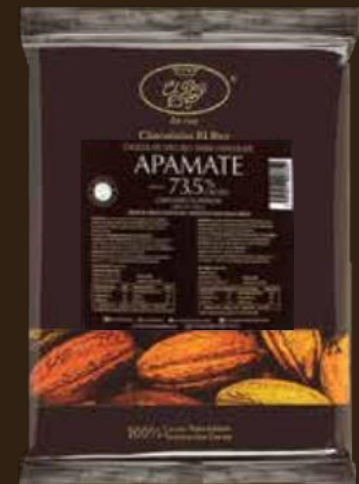
1 kg Bar