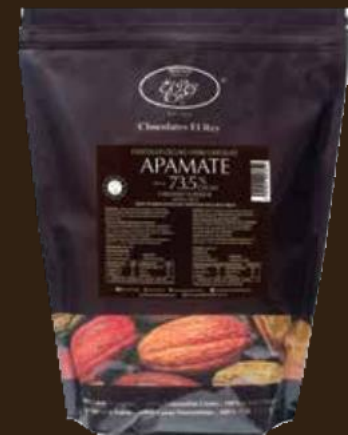
2 kg Discs Bags