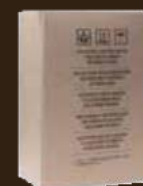
Case for 2 kg Discs Bags