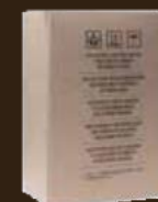
Case for 2 kg Discs Bags