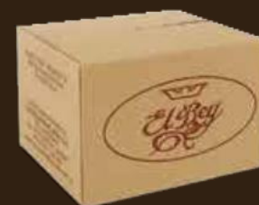
Box for 1 kg Bars