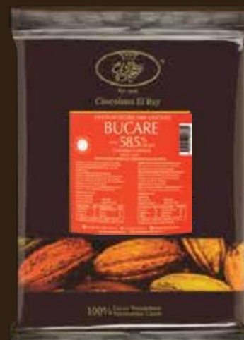
1 kg Bar